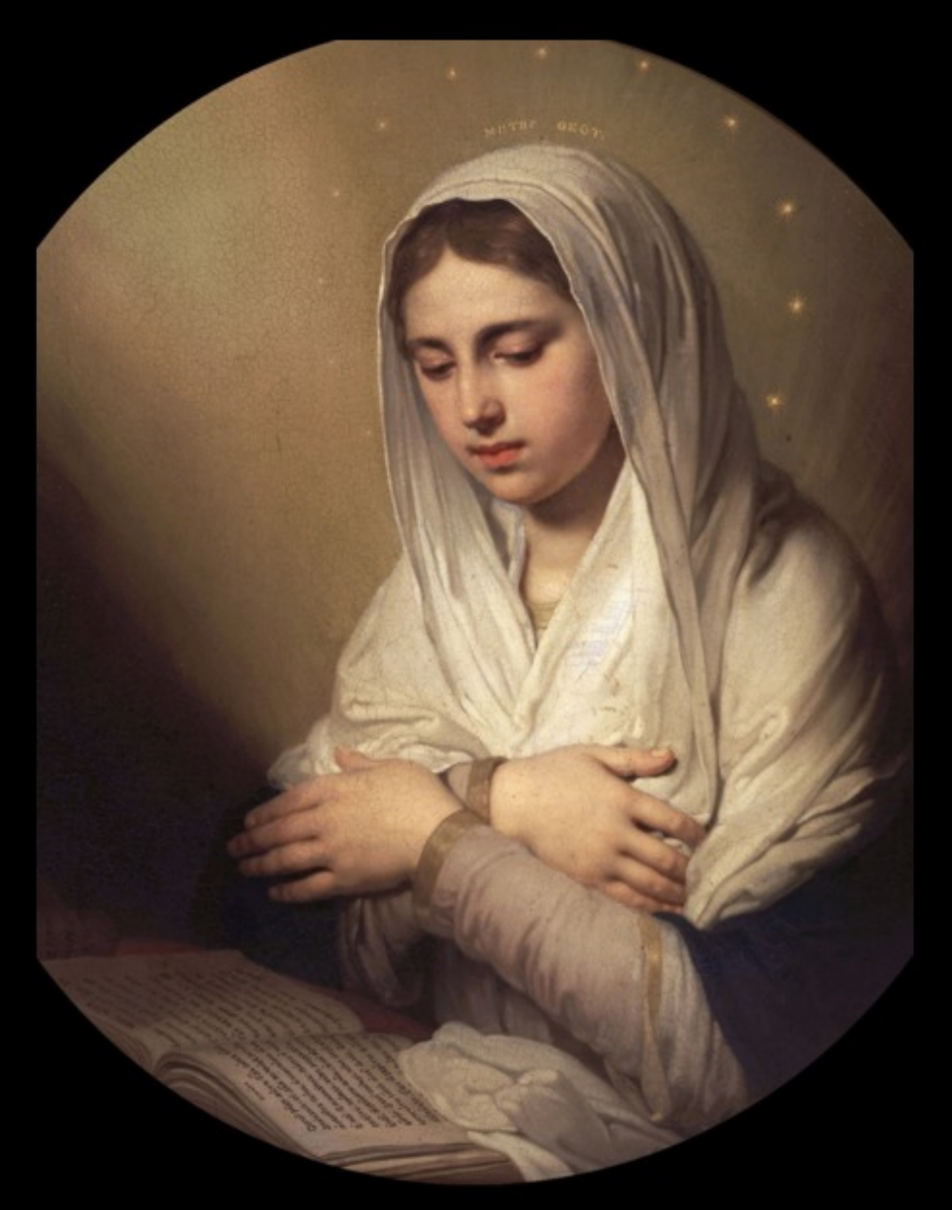
by Saint Louis de Montfort